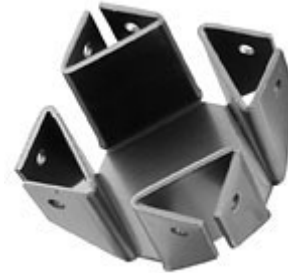
Representative Photo Only